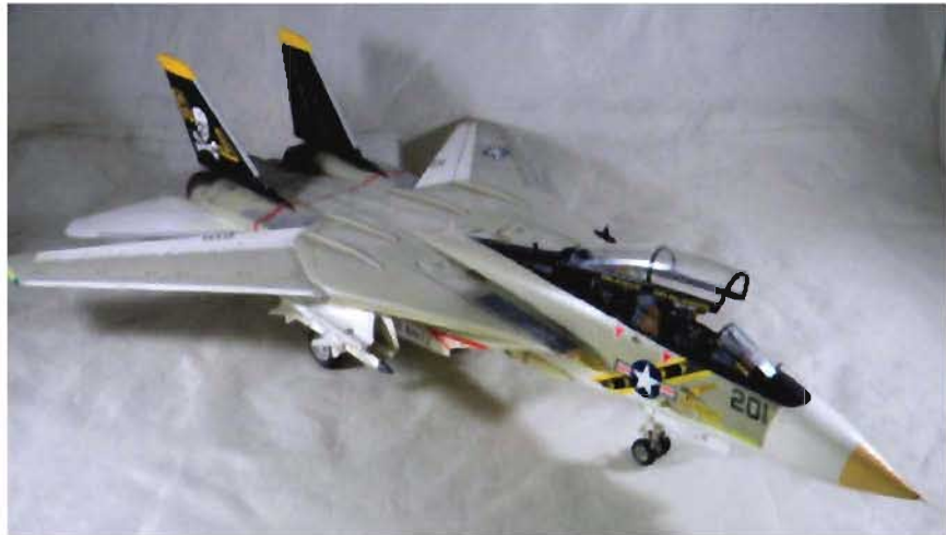
(Right) Mark Elder's Revell 1/48 F-14A "Tomcat" with VF-84 aftermarket decals and metal pitot tube. Builder's salute to the early 1980's Final Countdown time travel sci-fi movie.