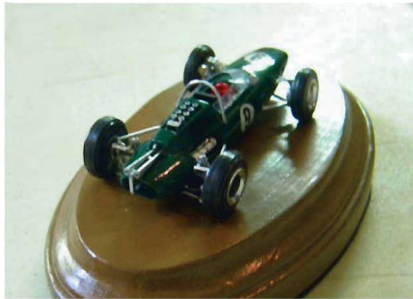
Kimiyoshi Okabe's Renwal 1/48 Lotus Ford