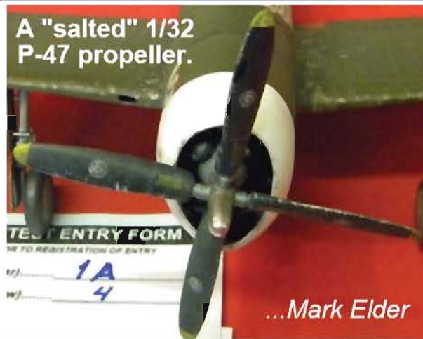
A "salted" 1/32 P-47 propeller.

I use distilled water, ordinary table salt and McCormick Sea Salt (do not grind!). Wet painted blades w/distilled water and follow up with sprinkle of salts. Be random and only partially cover blades. Allow to dry, gently blow off loose granules, then spray light coat of weathering color (oil, dirt, faded paint ...). Allow to dry, then brush off salt. Repeat until satisfied. Replicate worn metal on blades' edges, using silver artist's pencil or graphite pencil. WWII 8th Air Force P-47 or P-51 props may show very little weathering, but a Pacific island based F4U or P-39 prop will show major weathering. Also, try on other parts of aircraft.