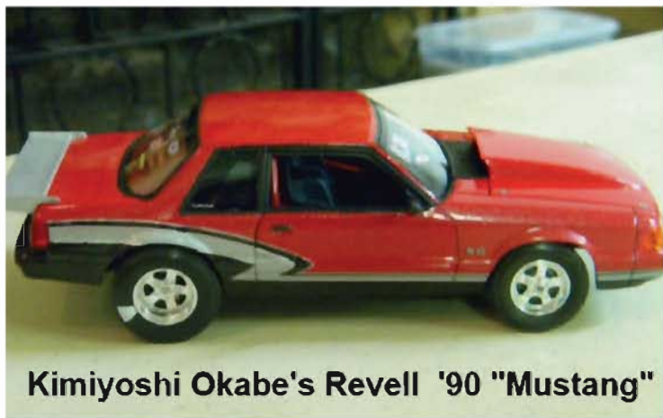
Kimiyoshi Okabe's Revell '90 "Mustang"