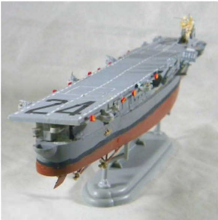
James Alvis' Dragon 1/700 CV-24 "USS Belleau Wood" jeep carrier