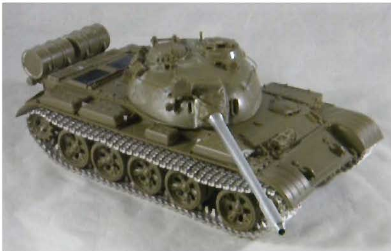
Editor's in-progress Tamiya 1/35 T-55 with metal aftermarket track and gun barrel, and brass wire handles on turret.