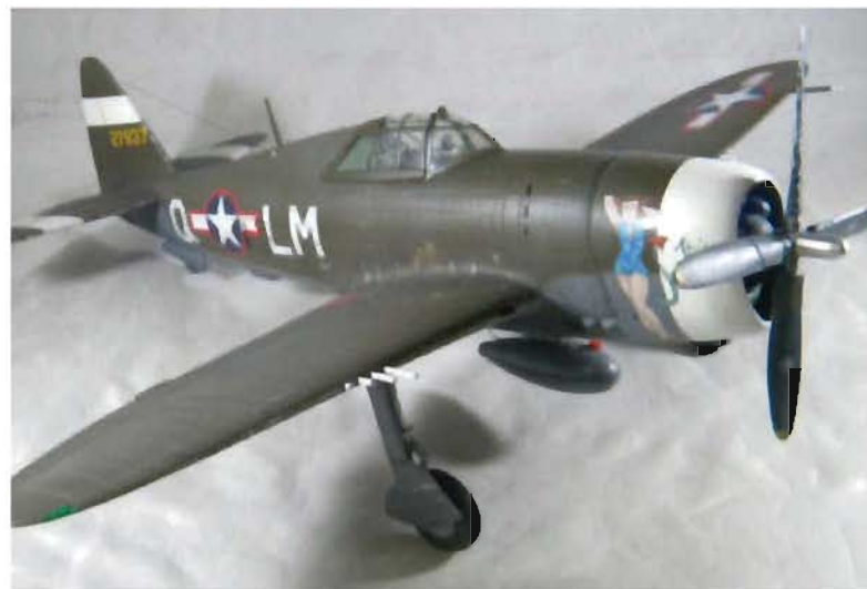
Editor's vintage Revell 1/32 Republic P-47D razorback Thunderbolt, "Triss", with aftermarket decals and Tamiya P-51D "Mustang" belly fuel tank w/plumbing. 8 machine gun barrels are aluminum tubing.