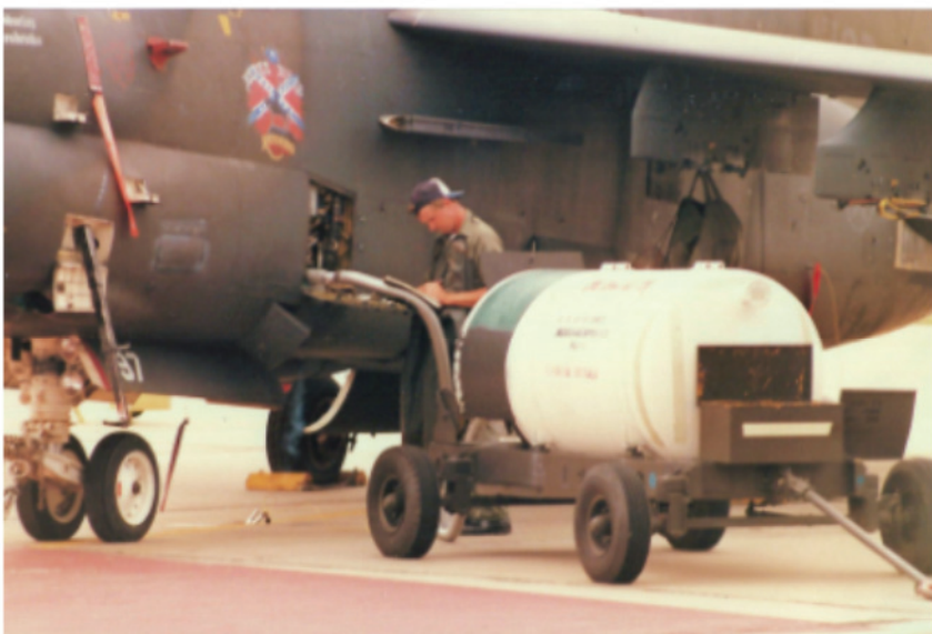
Ground crewman handling liquid oxygen IIRC. Note equipment bags hanging from wing rack, subtle variation of camouflage colors, and turn of crewman's hat.