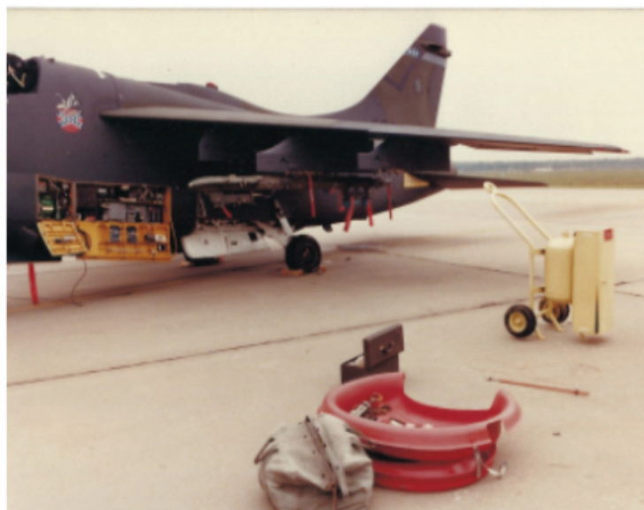
Step back from this A-7K, and the "NATO" camouflage appears to be overall Black.