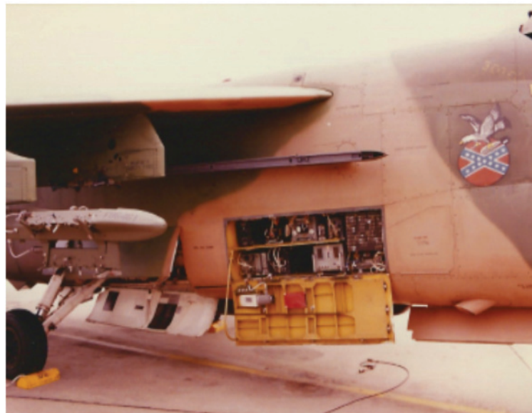
Opposite fuselage side more clearly showing electronics bay, and Sidewinder rail.