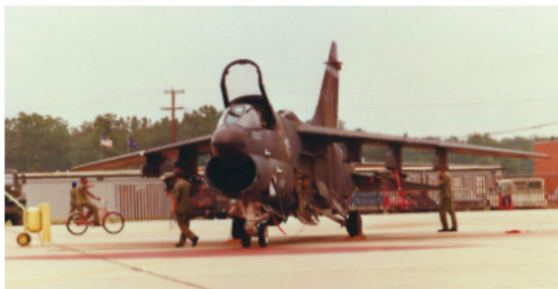
Aircraft gracing this page feature "NATO" paint scheme. This camouflage gives the A-7D a more sinister appearance. Note extinguisher and crewman riding bicycle in background.