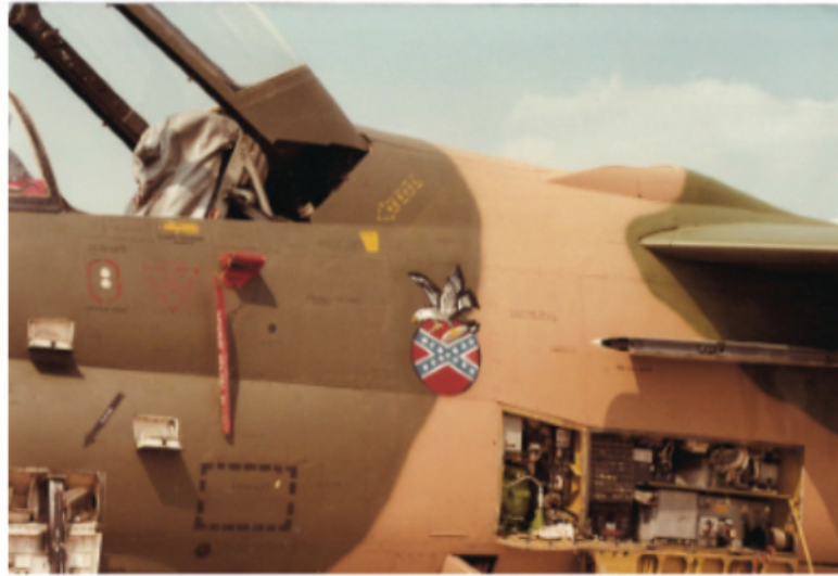
This shot shows easy access electronics bays, remove before flight tags, deployed access ladder & steps, and single rail sidewinder launcher. Note tightly sprayed camouflage.