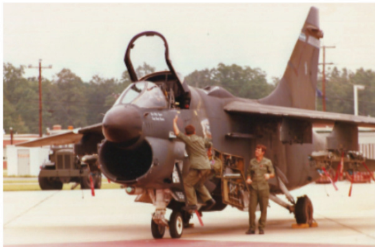
Ground crewman descends down access ladder upon completing cockpit maintenance.