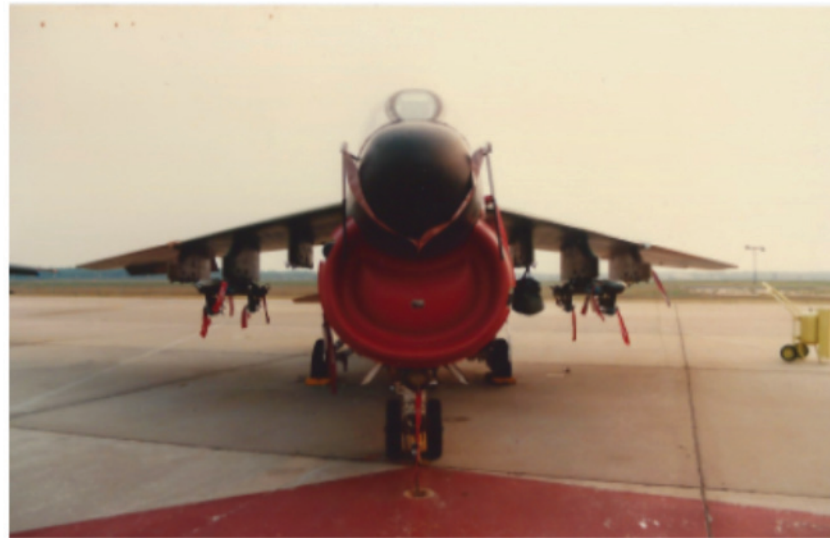
A-7D with plastic intake cover, small blue practice ordnance, and numerous remove before flight tags.