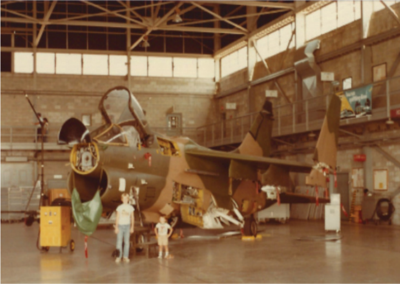
"Down & Dirty" A-7D inside the maintenance hangar, wearing the wrap-around SEA camo scheme. Note fabric intake cover, open radome, deployed access ladder, and white M.E.R. on wing rack.

The Spare Parts articles folder was bare, so I gathered the following photos from the mid-1980's, of the Virginia Air National Guard's 192nd Tactical Fighter Group's A-7D's being maintained, and preparing for dissimilar combat practice with Langley based USAF F-15C's assigned to the 94th Fighter Squadron (FS), 1st Fighter Wing. Maybe an enterprising modeler will find inspiration to construct a vignette with a Trumpeter 1/32 A-7D as its centerpiece, or maybe the Hobby Boss and still good Hasegawa 1/48 A7-D's. Hobby Boss also produces the A-7K 2-seater "SLUF" as some operators called all the subsonic A-7's. Some saw combat in 1989's "Operation Just Cause", to which the 192nd was deployed, just prior to converting to supersonic F-16 Falcons.