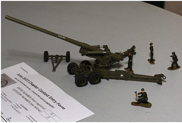
Tom Pulliam's M2/M59 155 mm Gun (3 rd Armor, Artillery, Vehicles)