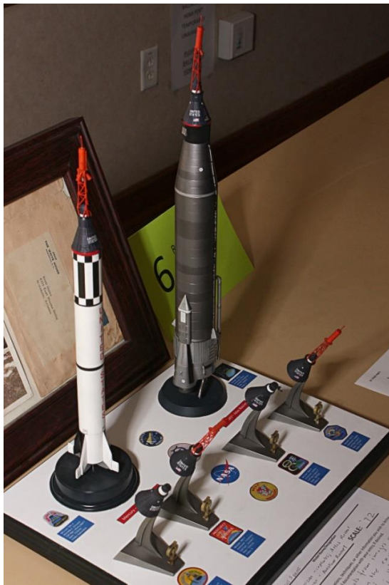
Scott Oates' NASA Mercury capsules, Redstone and Atlas display also included a special item of JFK memorabilia.