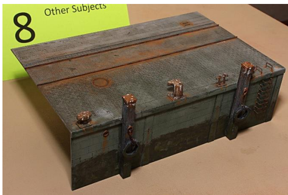
Tom Dailey's Old Wharf (1 st Other Subjects)