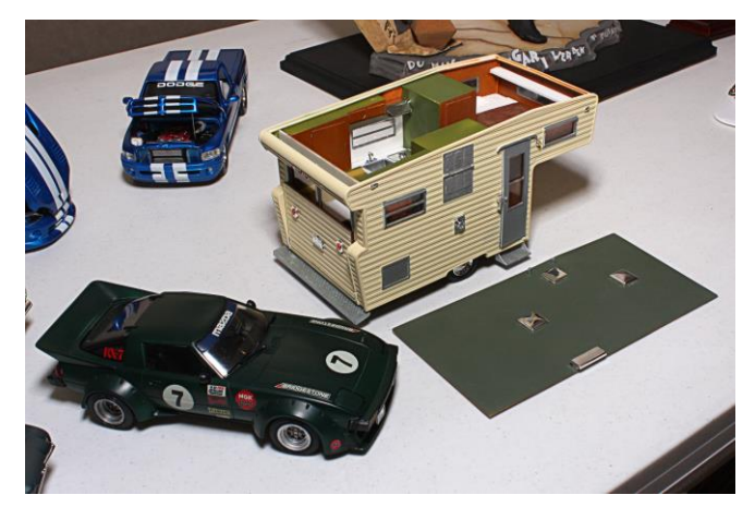
Mike's camper included a highly detailed interior.