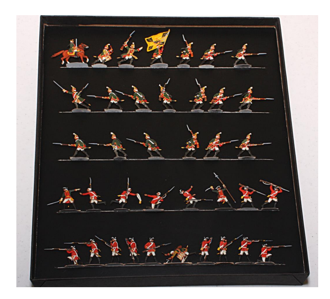
Rick Sanders' most impressive display of 30 mm Russian musketeers and grenadiers from the Seven Years War