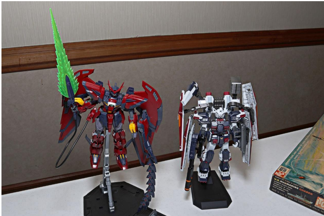
Mike Lyons' two Bandai Gundam figures, both 1/100 scale, Epyon and Thunderbolt with full armor.