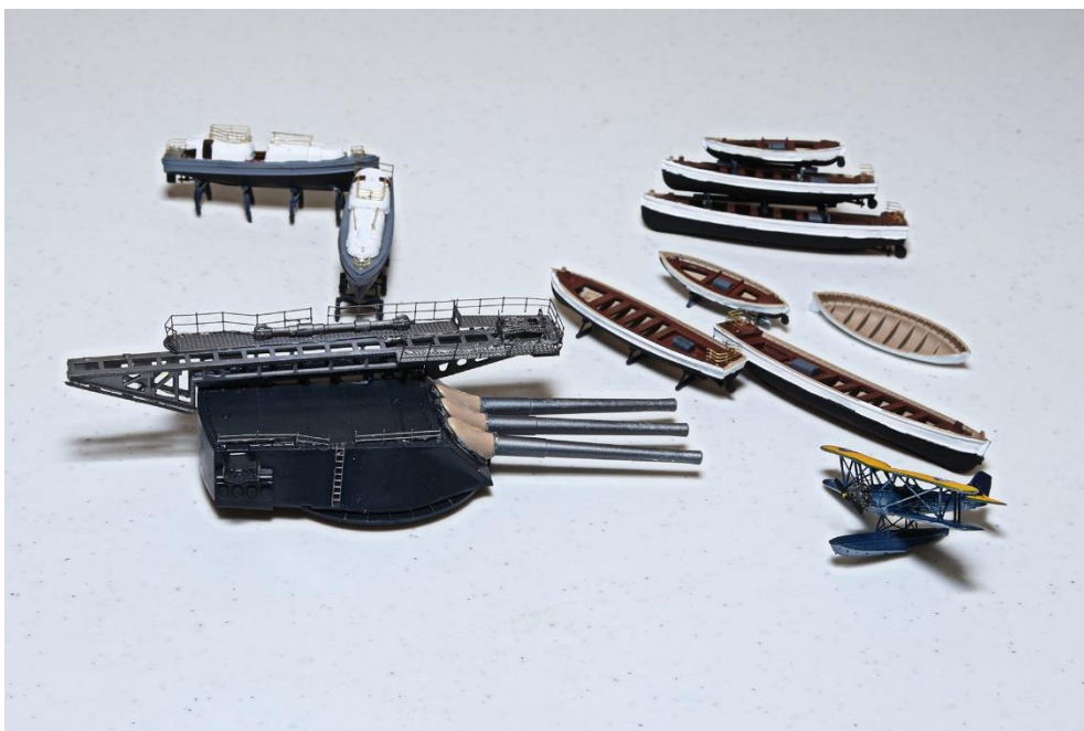
The models within the model: from Adam South's in progress 1/200 USS Arizona, an aft 14" gun turret with catapult and floatplane and an assortment of ship's motor launches and boats.