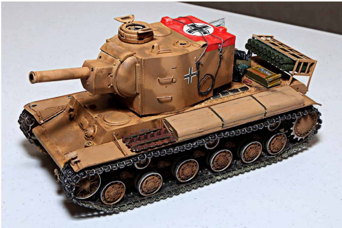
Tom Dailey's 1/35 Trumpeter KV-2 754 (R) Soviet tank in its new colors and markings following capture by the Germans.